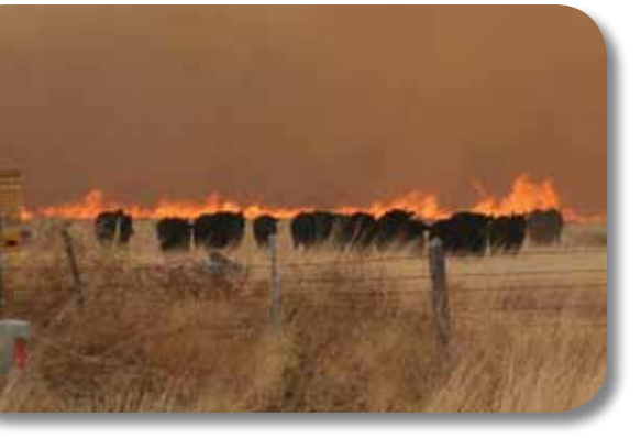
Farm and ranch equipment are vulnerable to wind-driven embers. Locate equipment in areas that have been cleared of vegetation and then monitor for spot fires.

Moving livestock to previously grazed areas will help protect them against an advancing wildfire and grazed pastures can also act as defensible space.