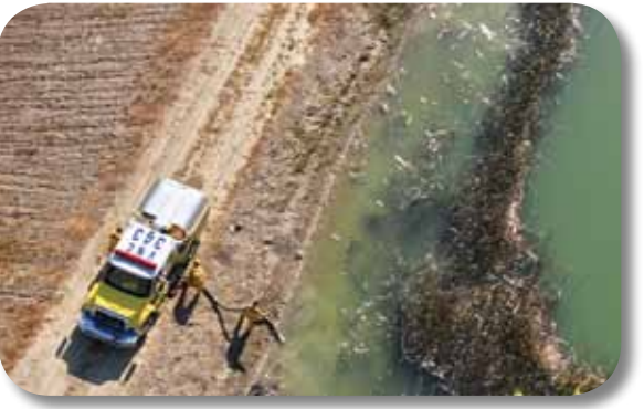
Clearly mark water tanks, hydrants and ponds so firefighters can use them to protect the property.