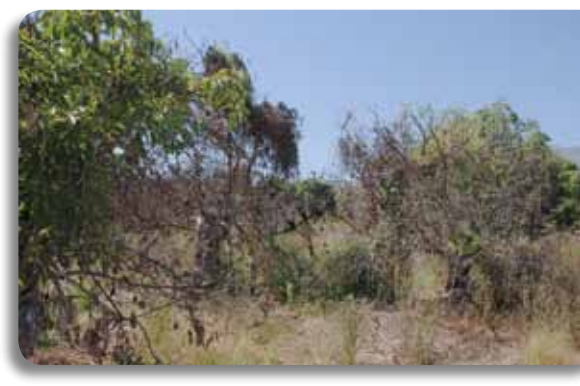
Well-maintained firebreaks and roads can help stop the spread of a fire through an agricultural property.

Dead trees and orchards overgrown with weeds can carry a fire deep into a grove, damaging both fruit and trees.