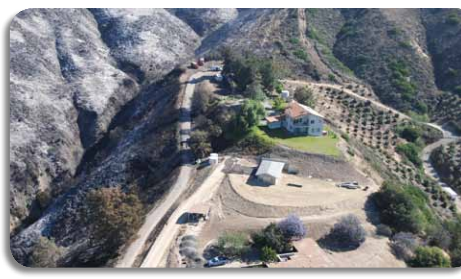
Defensible space around the property can help protect homes, barns and agricultural assets.

Ready, Set, Go! begins with property that firefighters can defend.