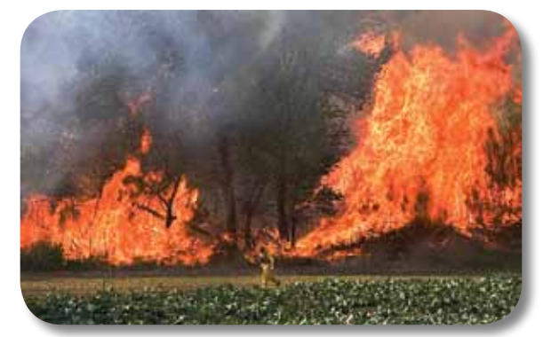
Radiant heat from wildfires generally only threatens the outside rows of crops being grown in the field. But embers can attack farm equipment and supplies.