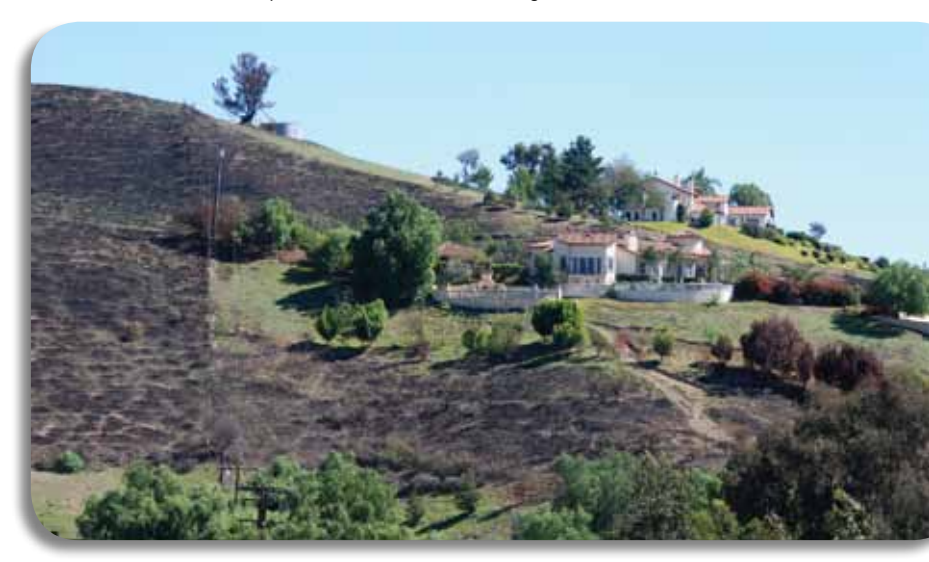
Fire-resistant construction along with defensible space can help protect against ember intrusion.