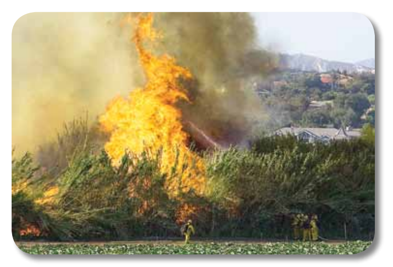
Row crops are not usually at risk from wildfires, but firefighters often access the fires through fields near natural vegetation.